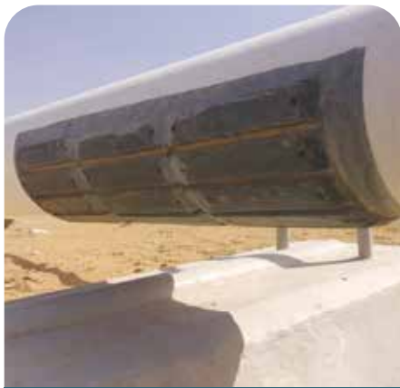
ROLLERKIT® ON PIPE