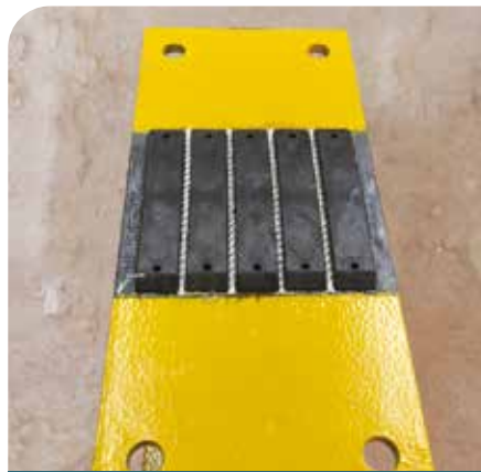
ROLLERKIT® ON SUPPORT